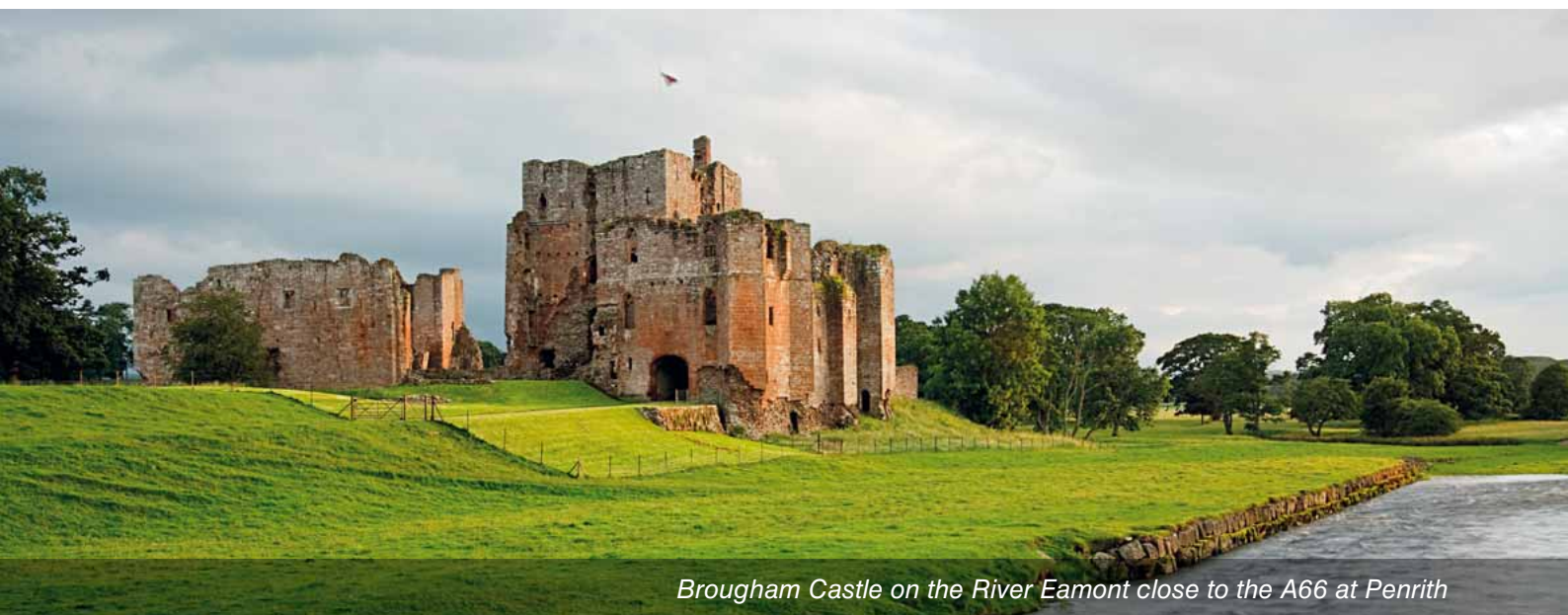
Brougham Castle on the River Eamont close to the A66 at Penrith